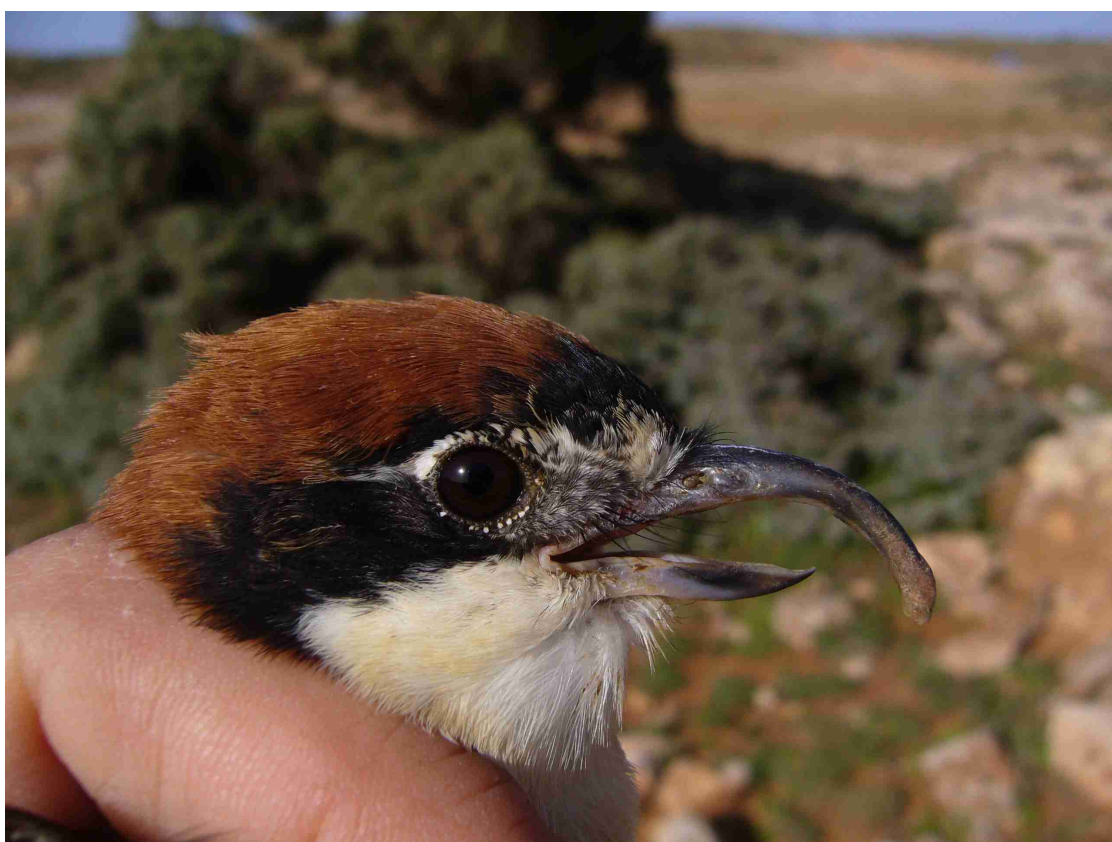
Photos 1 and 2: Woodchat Shrike Lanius senator senator with bill deformation close to Ifrane/ Morocco on the 24th of April 2008